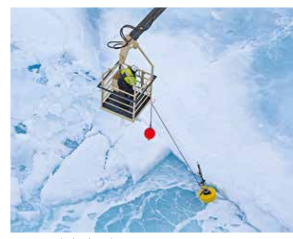
Retrieving a hydrophone buoy.