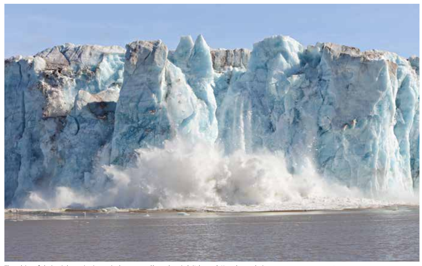
The calving of glaciers is becoming increasingly common. Shown here is Spitsbergen's Kronebreen glacier.

Knowledge about the climate system lays the foundation for understanding the relationship between natural climate variation and anthropogenic changes, as