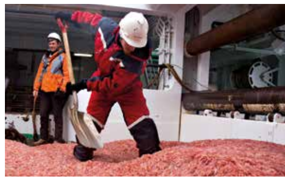
... and potential for increased harvesting of krill in the Antarctic.