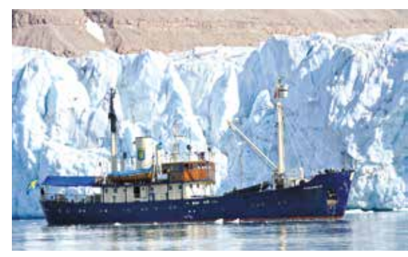
Maritime activity is expected to increase in Arctic waters – and the need for knowledge will grow accordingly.