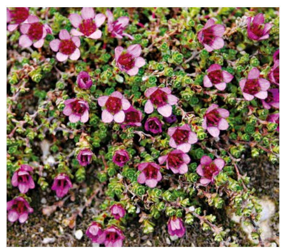
Red saxifrage, one of the world's northernmost species of plant.

It is important to gain a better understanding of the significance of ocean currents for physical and biochemical processes and natural variability in the