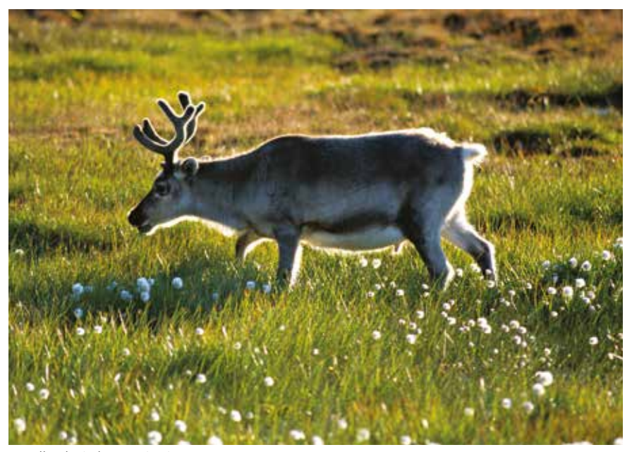
A Svalbard reindeer grazing in summer.