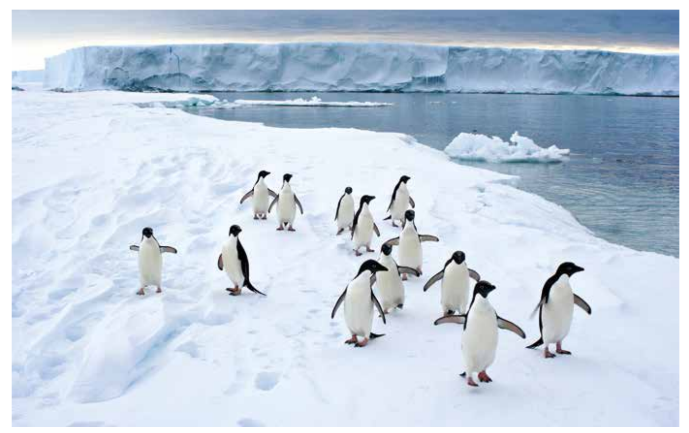
Adélie penguins in Antarctica.

More systematic knowledge is needed about the new conditions for economic activity that are emerging in the wake of rapid environmental and climate change. It is equally important to define which restrictions are needed in order to prevent undesirable changes in the environment and climate, particularly in the Arctic. Key issues to study include potential conflicts of interests resulting from these restrictions, as well as new governance and negotiation challenges that may lie ahead. Knowledge about the role of trade and industry, and multinational corporations in particular, in managing and utilising the natural resources of the polar regions is essential as part of the basis for