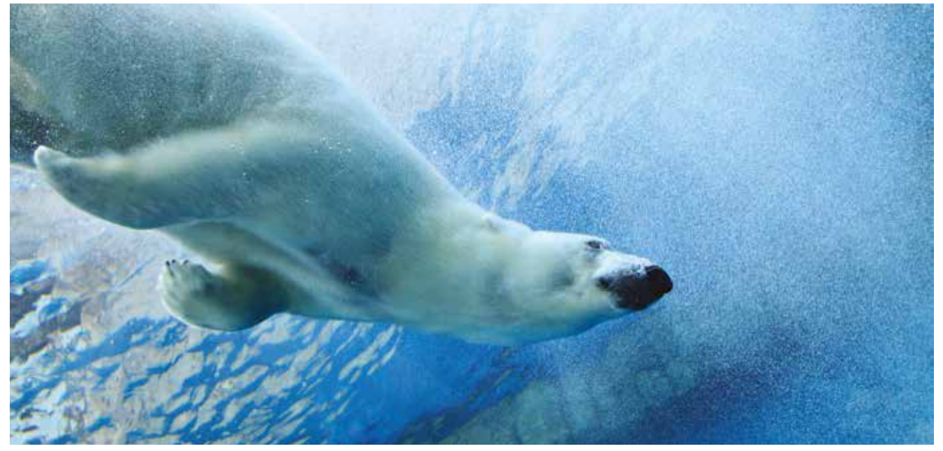
Polar bears are marine mammals that spend much of their lives hunting seals on sea ice.

Ensuring peaceful development of the region in a manner that promotes responsible management of resources and the environment will require the stakeholders to find legal and agreement-based solutions across a wide range of issues. There is a need for more knowledge about the various stakeholders' understanding of issues relating to the management of the polar regions and the rights of indigenous peoples.