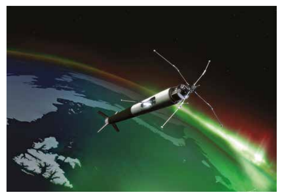
Research rockets can be launched into the northern lights from Andøya and Svalbard. Illustration: Trond Abrahamsen/ARR

<sup>11</sup> Report No. 22 (2008–2009) to the Storting.