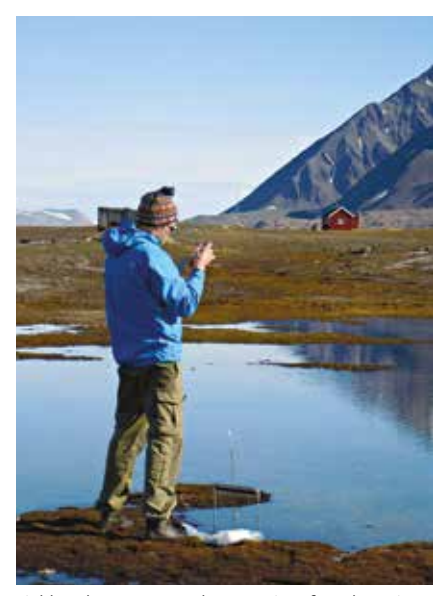
Fieldwork to measure the quantity of methane in the wetlands of Brøggerhalvøya, Spitsbergen.

Efficient data management is the key to integrating activities across national, institutional and disciplinary boundaries. Data collected with the help of public funding must be made available to other researchers. This means that the data must be adequately documented, searchable