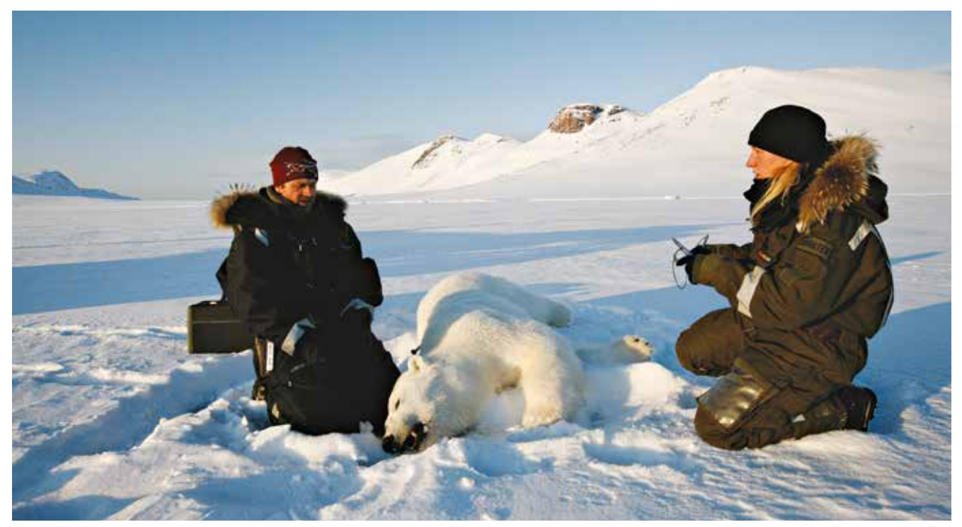
Providing more grants for fieldwork in the polar regions is one measure for promoting recruitment of new researchers. Here an example of polar bear research in the field in Svalbard.

areas for activity in Svalbard. Svalbard is to be further developed as a platform for Norwegian and international research with clear-cut Norwegian scientific leadership and presence. The Svalbard Science Forum (SSF) is an important tool for scientific and practical coordination of research activities in Svalbard. The Svalbard Integrated Arctic Earth Observing System (SIOS) is an international project on the European Strategy Forum on Research Infrastructures (ESFRI) Roadmap. All key research institutions with research infrastructure and activities in Svalbard are involved in SIOS. The objective of SIOS is to coordinate, make accessible, upgrade and further develop observation systems for Earth system research in Svalbard. Both SSF and SIOS are thus important building blocks for further developing Svalbard as a platform for international research cooperation.