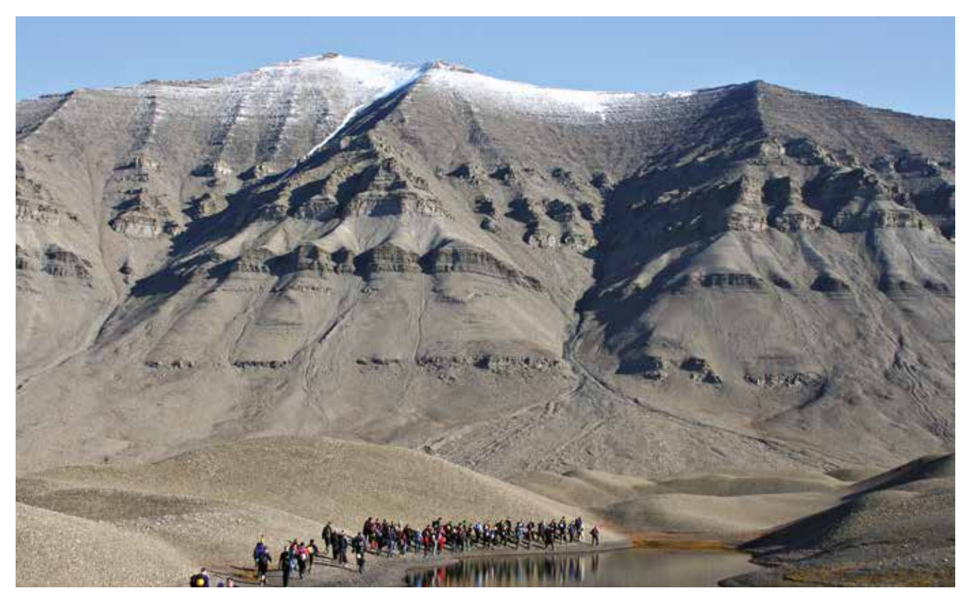
Svalbard is a natural research laboratory attracting many scientists, such as these geology students on an excursion.

conventions. Important conventions for the polar regions are: the United Nations Convention on the Law of the Sea: the Geneva Convention on the Continental Shelf: and the Convention on Biological Diversity (CBD). Treaties and conventions that apply specifically to the Antarctic include: the Antarctic Treaty, which regulates all activity on the world's southernmost continent; the International Convention for the Regulation of Whaling; the Commission for the Conservation of Antarctic Marine Living Resources (CCAMLR); and the Protocol on Environmental Protection to the Antarctic Treaty (the Madrid Protocol). For the Arctic, the following organisation and treaty play a key role: the Arctic Council, which is an intergovernmental forum for Arctic cooperation, and the Svalbard Treaty, which