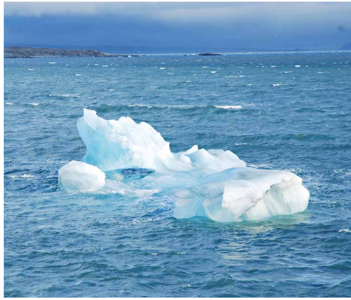
Melting ice masses, such as here in Svalbard's Hornsund fjord, affect the marine environment.