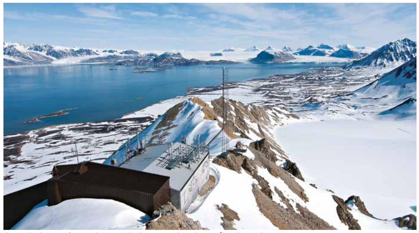
The Zeppelin observatory for atmospheric research and monitoring is located near Ny-Ålesund on Spitsbergen.