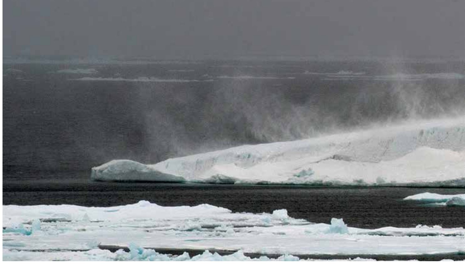
Despite the harsh climate, human activity in the polar regions is increasing.