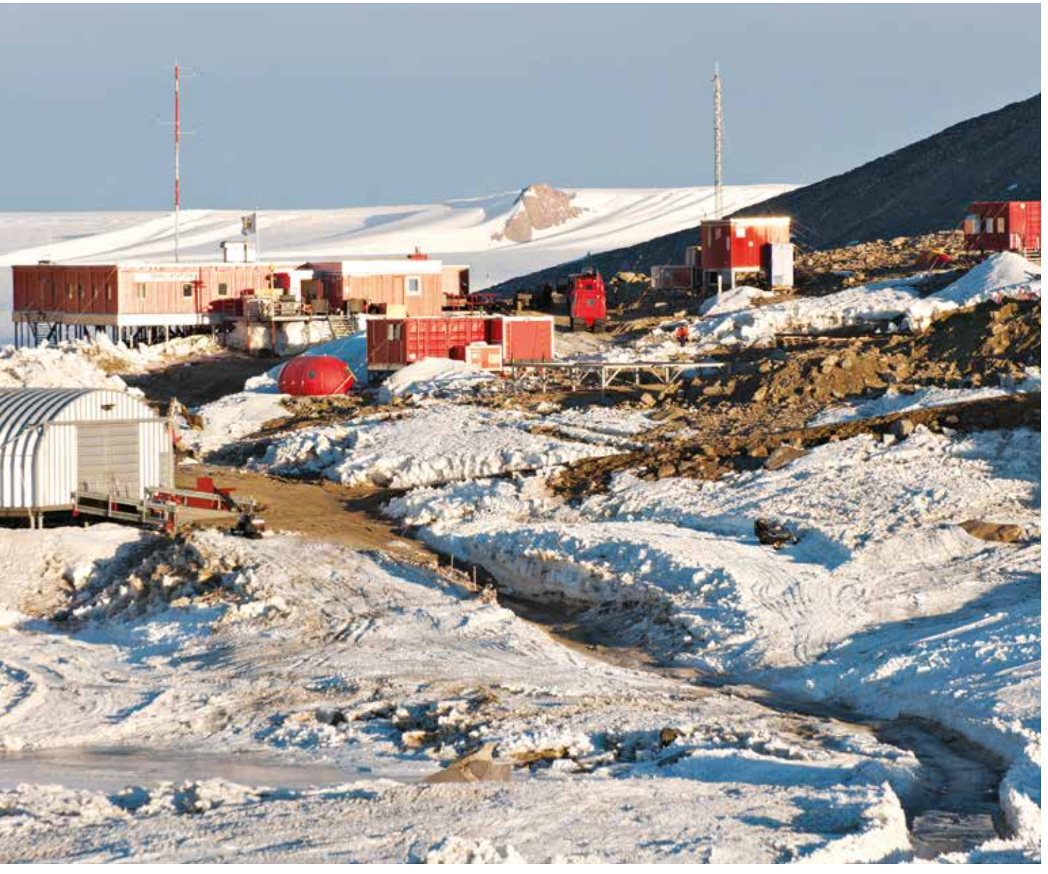
Troll is Norway's research station in Antarctica, and is in operation year-round.