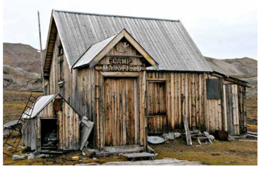
Remnants of human activity at Camp Mansfield on Svalbard's Blomsterhalvøya.

In the polar regions there are cultural monuments from Norwegian and international economic activities, from the early exploration of the areas and from indigenous peoples' settlements and lives. Cultural heritage research provides insight into the past, present and near future. Climate change is causing challenges for the preservation of cultural monuments in the polar regions. Identifying and understanding these challenges and how to address them are important tasks in preserving cultural heritage in the Arctic and Antarctic. Norway must continue to play a major role in the established international research on polar cultural monuments.