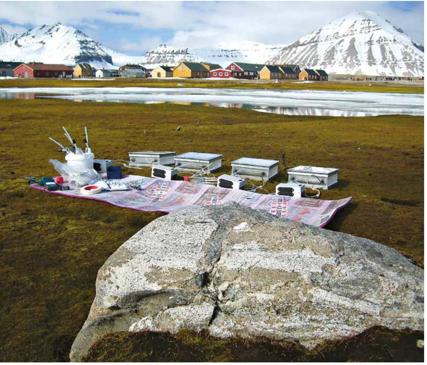
Measurements such as these at Ny-Ålesund quantify the methane gas released when permafrost thaws.