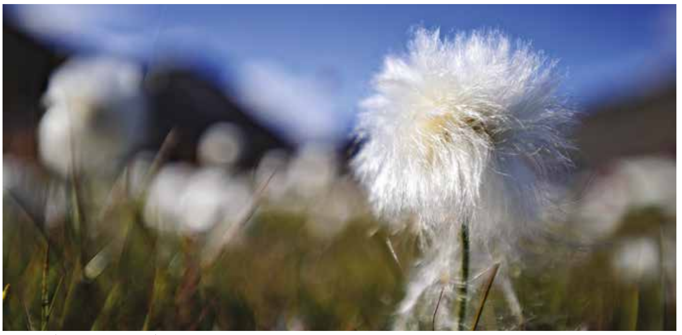
Eriophorum (often called cottongrass) is a hardy plant commonly found on the Arctic tundra.

<sup>1</sup> Working group 1 report: The Physical Science Basis.