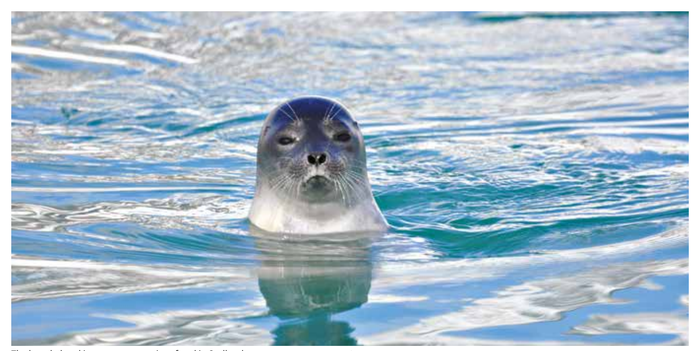
The bearded seal is a common species of seal in Svalbard.

It is presumed that Norwegian polar research will comply with the highest environmental standards to limit the footprint on these unique polar environments to the greatest possible extent. Research activities will follow the guidelines drawn up by the National Committees for Research Ethics in Norway.