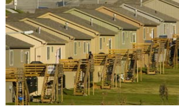
The US subprime mortgage crisis had a global impact, illustrating that capitalism and liberal values are associated with risk.