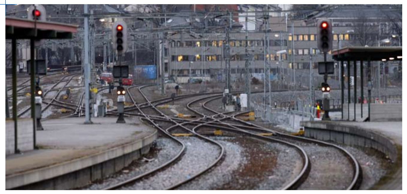
A cable fire in 2007 at Oslo's central train station led to an electrical shutdown, bringing all railway traffic to a halt. Thousands of subscribers also lost access to the Internet.

"A common meeting place is important. Different sectors share many of the same problems, and it is beneficial to think of the broader picture and to view the consequences from many different angles. We will then see the connections more clearly and gain a stronger sense of the individual spheres of responsibility," says Hokstad.