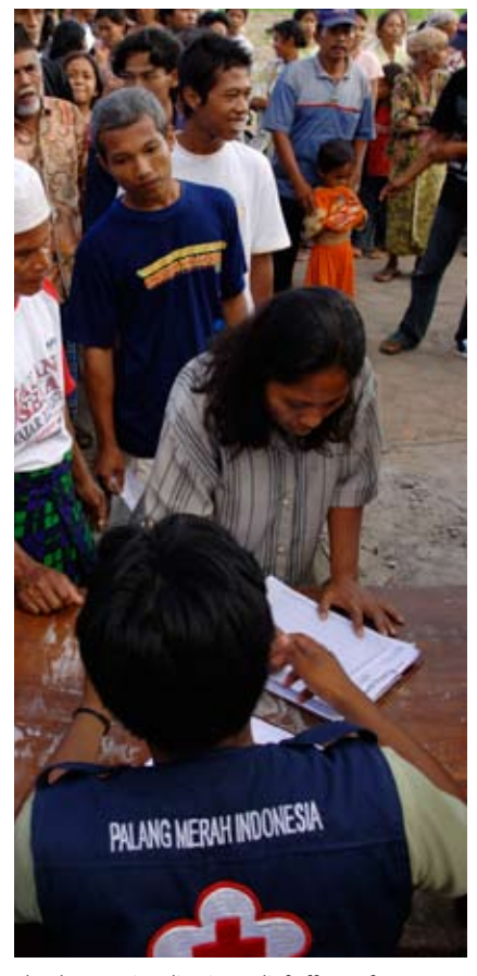
Thanks to regionalisation, relief efforts after the 2006 earthquake in Indonesia were launched in record time.

Helping people in the wake of a disaster is a complex and chaotic affair. Still, relief efforts can be carried out more efficiently – for example through better preparedness. This is where experts in traditional logistics have valuable knowledge to contribute.