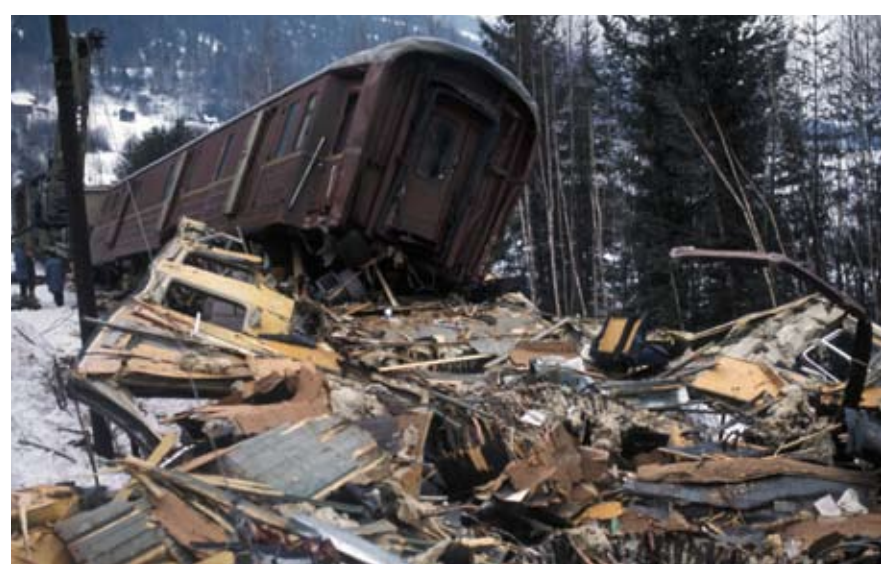
The railway accident at Tretten station is Norway's worst since WWII. On 22 February 1975, an express train collided with a local train, killing 27 people.

The ACCILEARN research project is based on the hypothesis that accident investigations as currently conducted do not play an important role in learning for individuals or organisations across societal sectors. "It is a challenging hypothesis. Once we begin examining this,