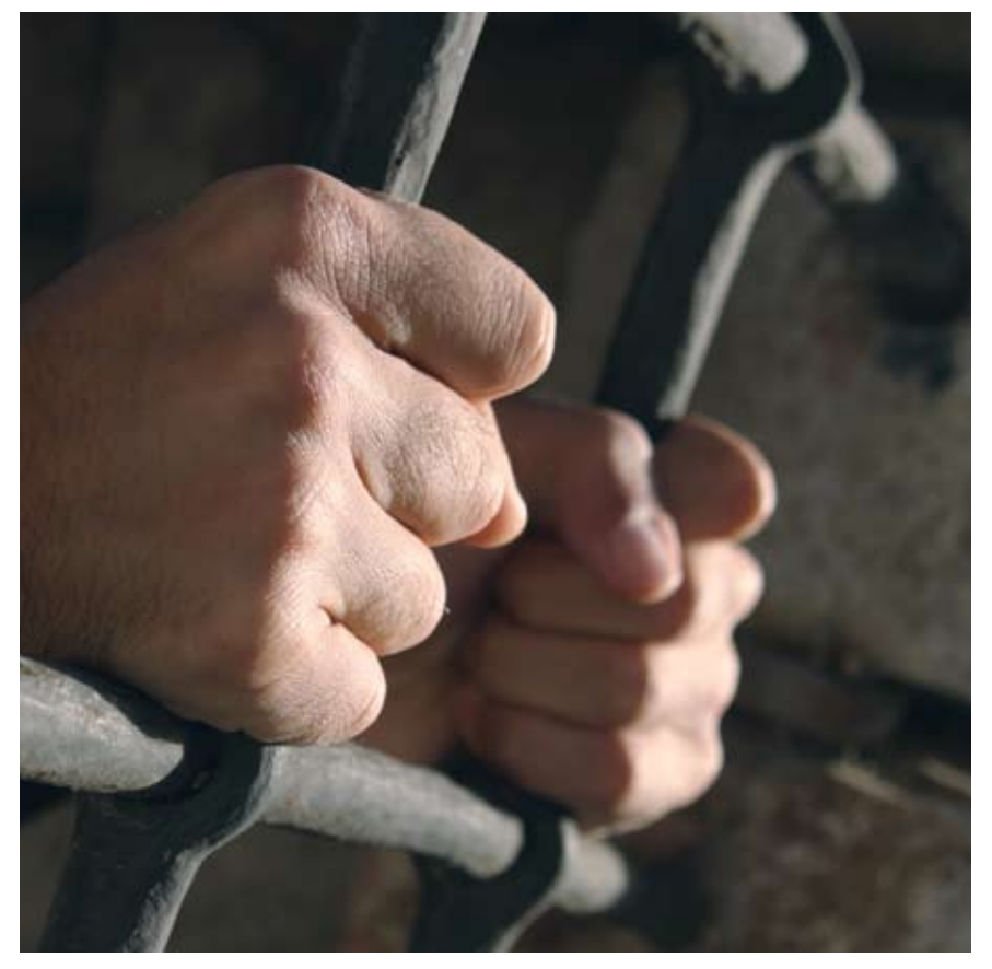
There is a trend to criminalise activities that used to be lawful – for instance, an action may be deemed a crime before any assault has occurred.

"What before were lawful preparations have now become criminal offences. This means a move away from punishment as a reaction to punishment as a means of prevention. We have seen this move from reactive to proactive criminal law since the mid-1990s," says Professor Hennum.